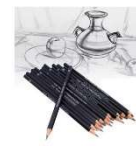
14pcs Fine Art Drawing Pencils